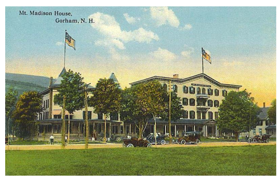
Mt. Madison House Before Becoming Our Lady of the Mountains Academy

Our Lady of the Mountains Academy opened in 1946 in the old Mount Madison Hotel, which had been closed for a few years. The academy continued to serve young women, mostly from out of state, until the mid sixties. In 1956, the Edward Fenn Elementary School was built and dedicated.