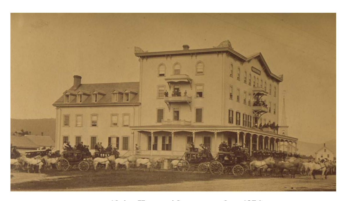
Alpine House with stage coaches, 1876

The Alpine House, situated where the tennis courts are now, burned down in 1873 and was rebuilt two years later. During that same period, a large first-class hotel was constructed on the summit of Mount Washington, and news of that appeared in the newly founded newspaper, The Gorham Mountaineer .